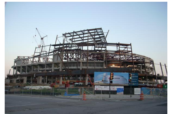
BOK ARENA under construction in Tulsa, Oklahoma