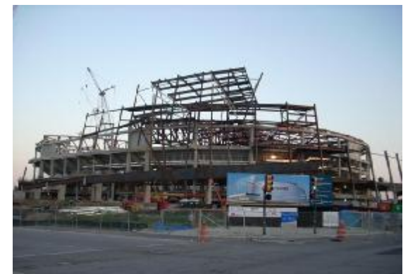
BOK ARENA under construction in Tulsa, Oklahoma